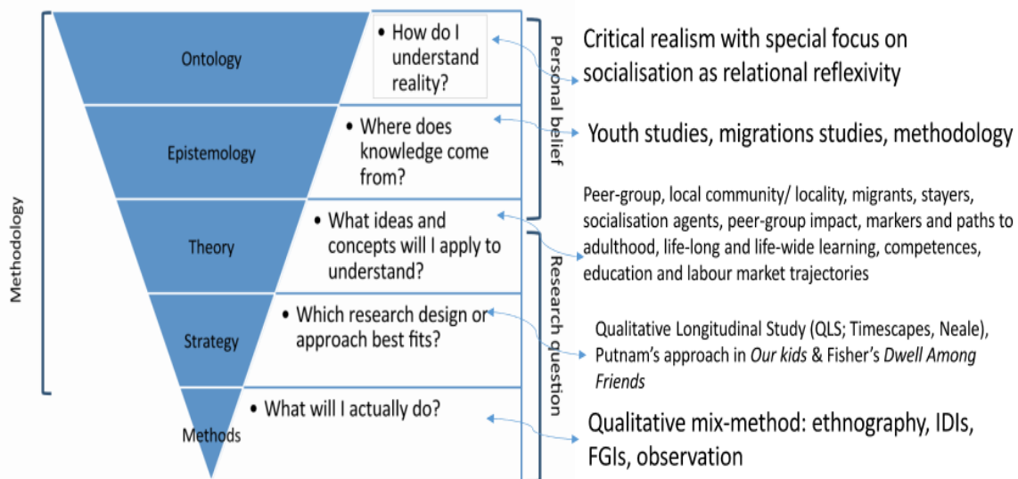
Figure 3.1. Methodology